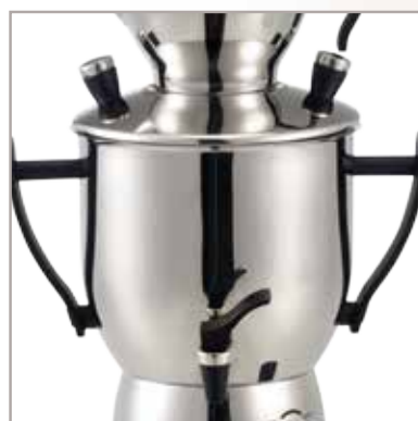
3.0 l water container