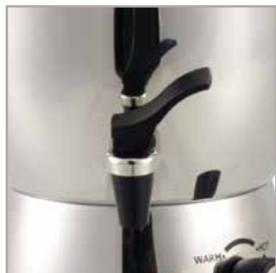
Tap with scale filter