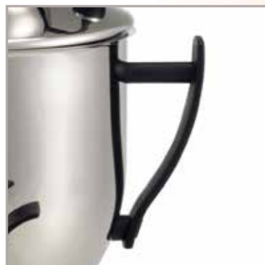
Elegant, heat-insulated handles