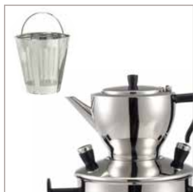
1.2 l teapot with tea strainer